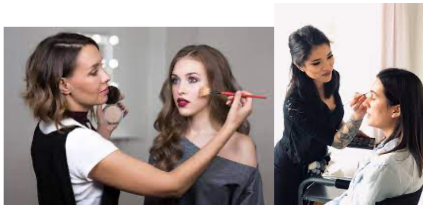
Pic. 1. Look image makeup artist

Professional image. First impression is key to everything in the society we live in. When a client hires a makeup artist, they expect a professional who is not only talented but also a prime example of their own skills as well. It is very important to set yourself goals and note that the behavior portrayed is noticed by the client.