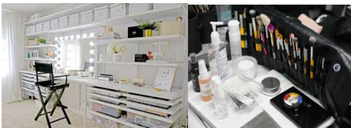
Pic. 3. Makeup workstations