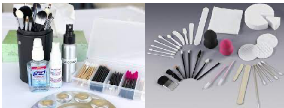
Pic. 2. Tools, brushes and materials