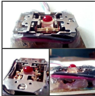
Fig.1. Laboratory model system shear deformation

To create a system of shear deformations, it was decided to use a block electromagnetic focusing used in optical recording devices (CD-ROM, DVD-ROM). The dimensions of this device are allowed to put it in the camera the primary Converter for photometric studies. Instead of the focusing lens was installed in the cuvette for placement of drip samples. Photo presented in figure 1.