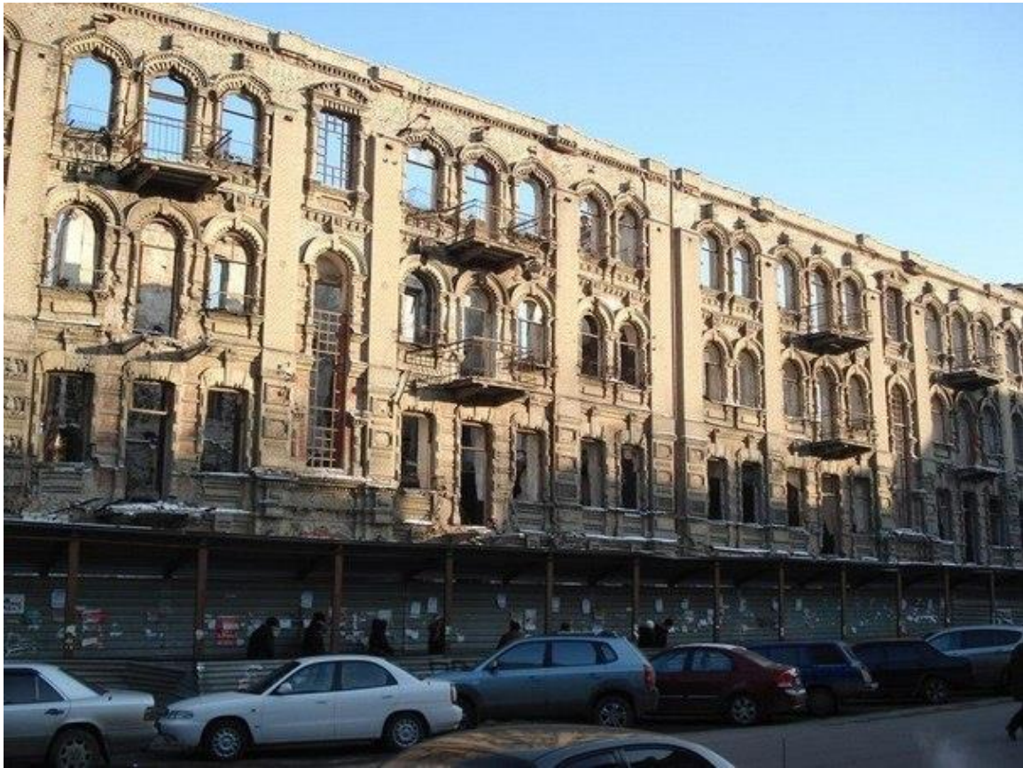
Figure 3. «Pomerantsev's House», Kharkivska, 6