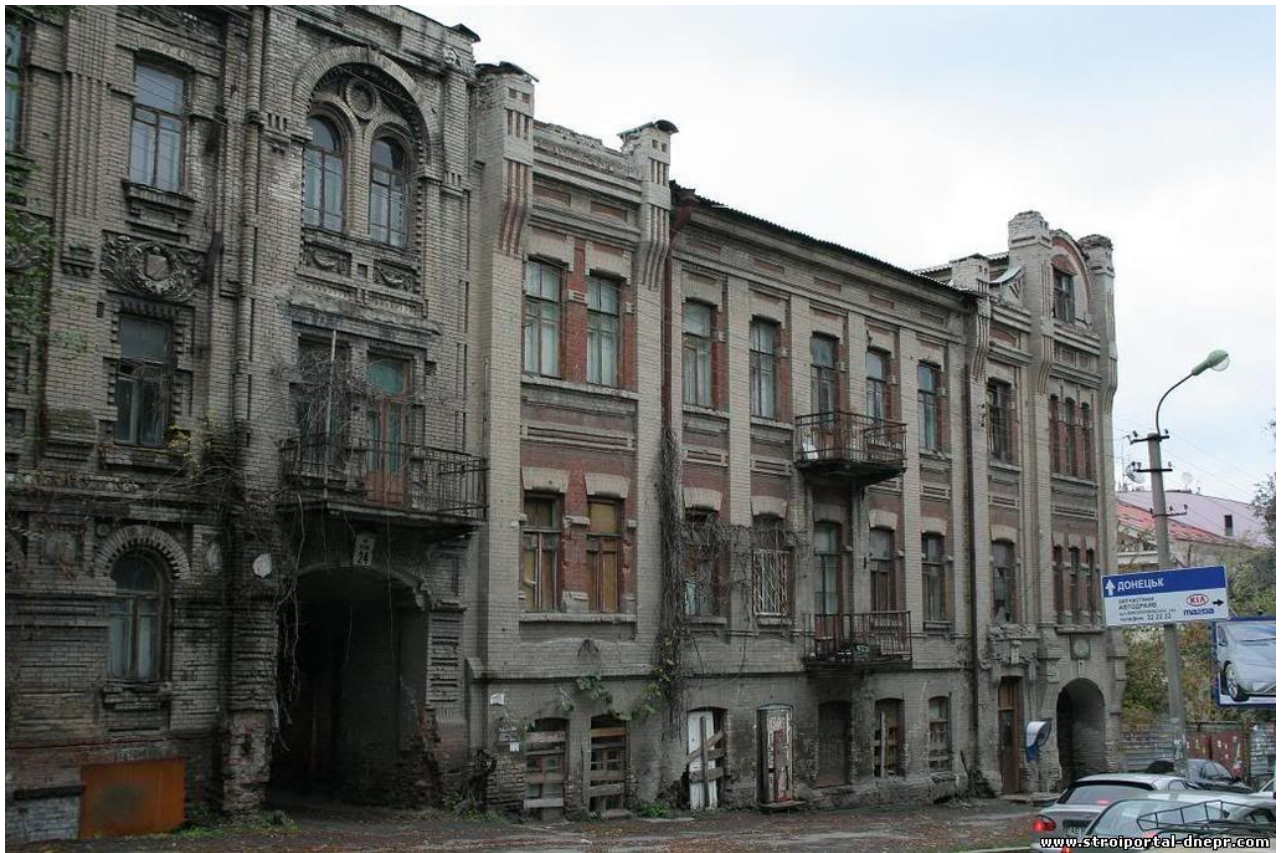
Figure 5. The complex houses on the street address Artem 22,24,26.