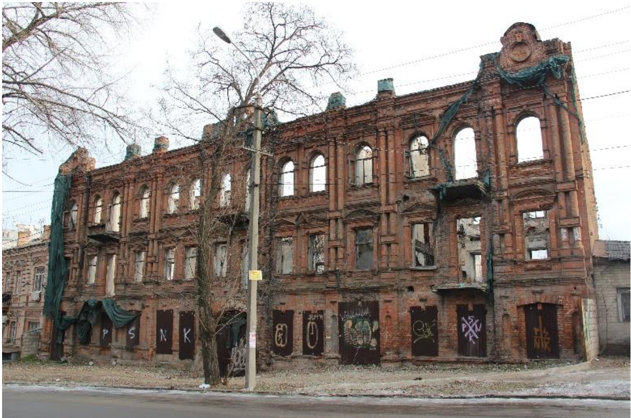
Figure 4. Home address street Beconase, 17