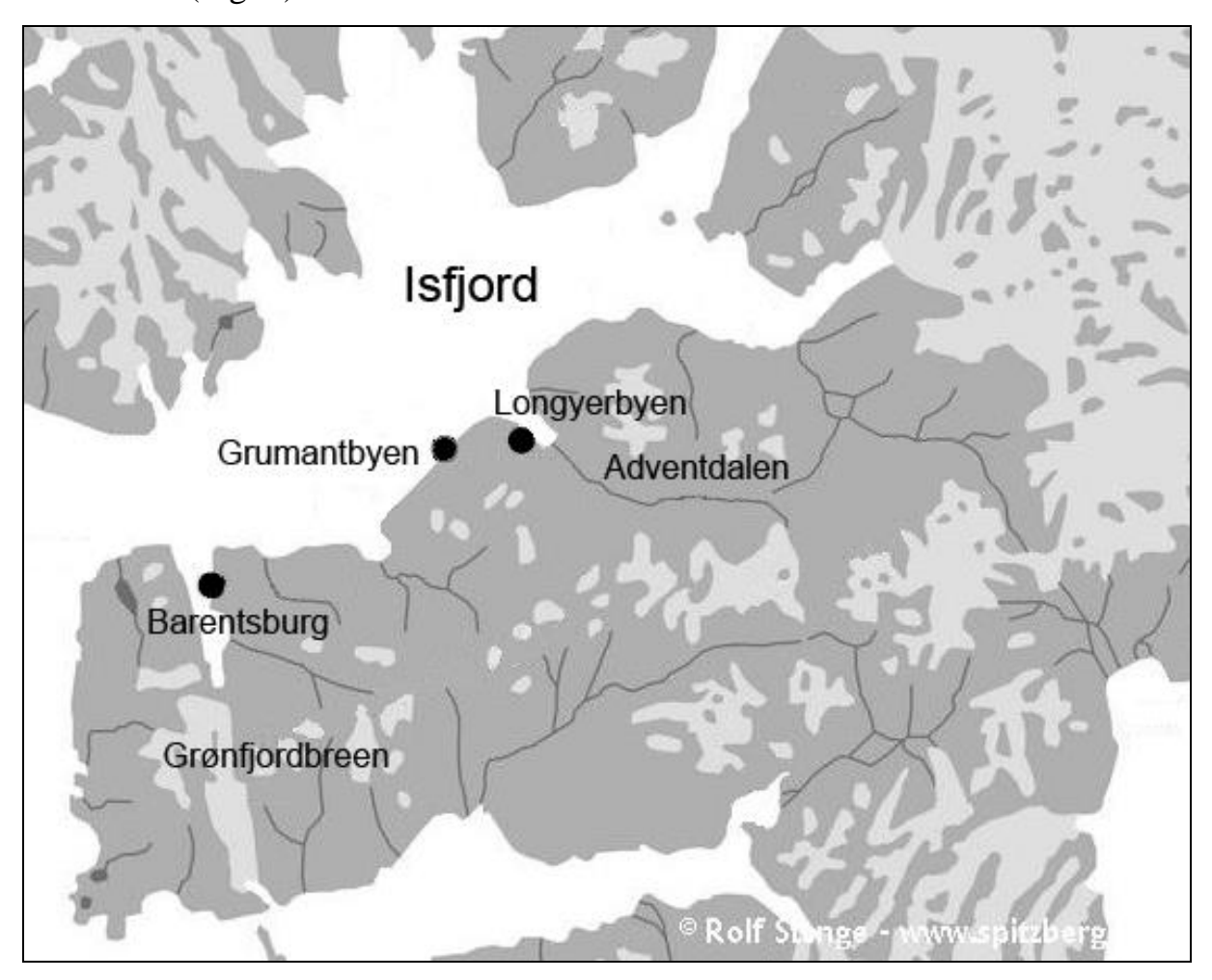
Fig. 1. Location of the snow sampling sites.

attracted snowmobile track close to these settlements: vicinity of Grumantbyen abandoned settlement, glacier Grønfjordbreen, Adventdalen valley and vicinity of Gruve 7 (Fig. 1).